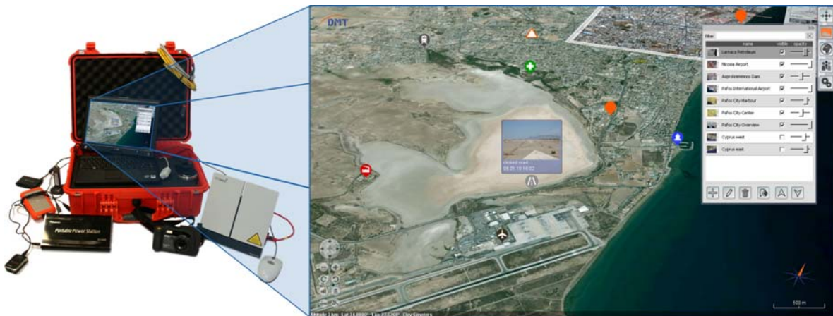
Figure 2. Disaster Management Tool (DMT) Mapcase-Hardware and Demonstrator-Software screenshot

Performing many revolutions of the development spiral we have developed a system [Angermann2009] that fulfils the requirements given in the previous section. The system tightly integrates software and hardware components (tablet computer, BGAN satellite modem, GPS camera, etc.) and is currently undergoing final tests before being released for assessment missions (Fig. 2). The system has been specifically designed for usage by disaster experts without IT-background and includes a highly optimized user-interface and fully automatic synchronization.